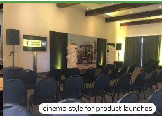
cinema style for product launches